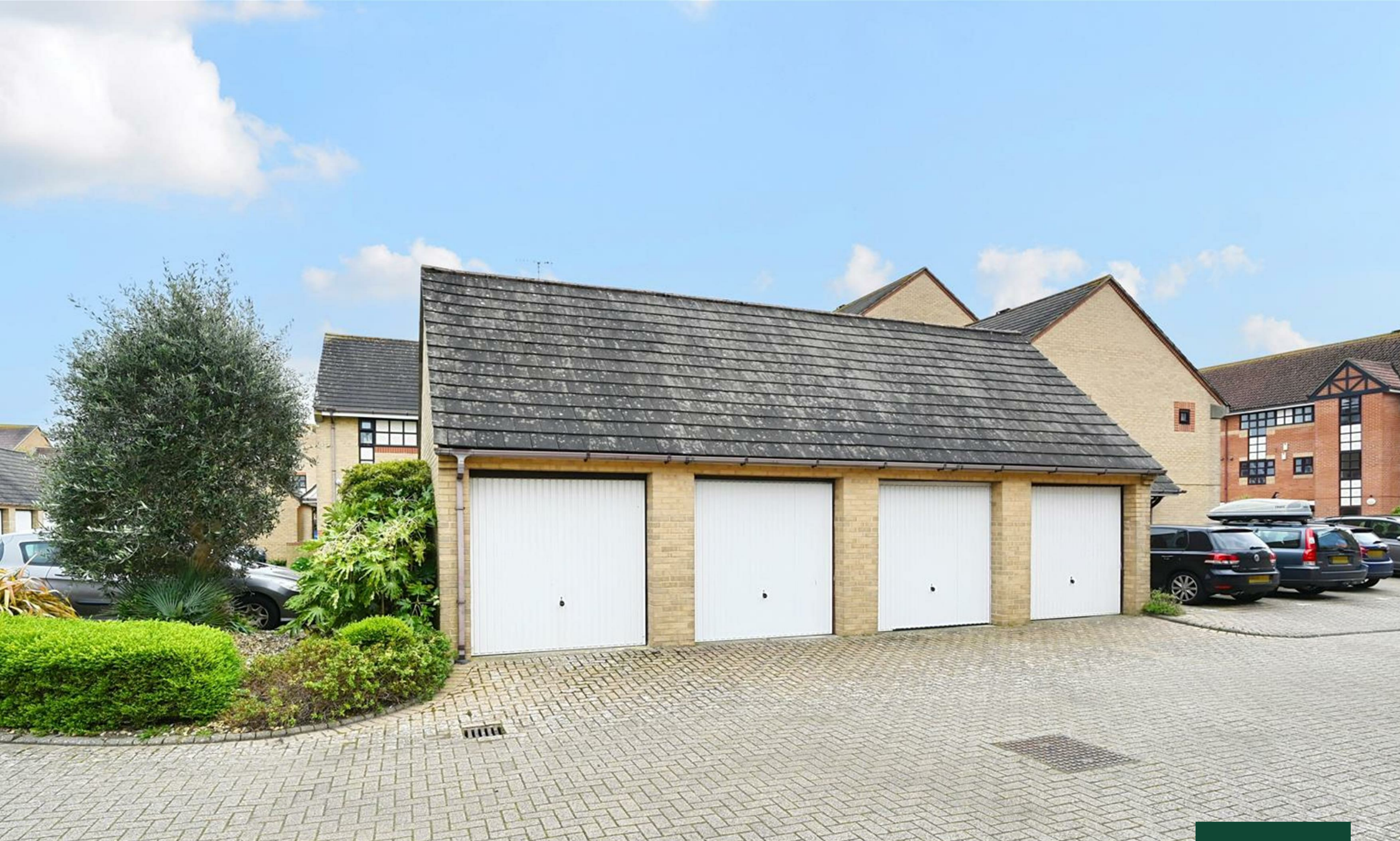
Garage 106 Emerald Quay | | Shoreham-By-Sea | BN43 5JS